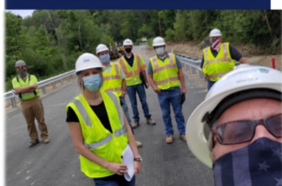
Lessons Learned in Construction 2020-21