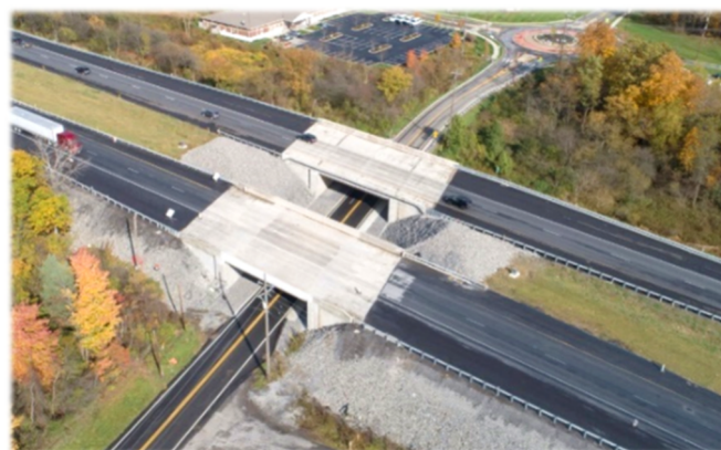
I-79 over North Boundary Road

Due to the rapidly deteriorating existing structures and complications with the existing caisson-supported multi-column piers arising from phased construction, the team determined traffic would best be maintained via a temporary roadway/bridge in the I-79 median between the dual structures. This allowed the project to proceed on an accelerated schedule and within existing right-of-way (ROW), eliminating the need for ROW takes or temporary construction easements. The existing southbound bridge was replaced first due to its condition. During the first construction season, two lanes of southbound traffic were shifted onto the temporary roadway/bridge while the southbound bridge was replaced; this sequence was then repeated for the northbound structure in the second construction season. Though District 10 had previously used temporary bridges on non-interstate projects, this marked the first project to use a temporary bridge on an interstate within the District. Closures on North Boundary Road were limited to 3 weekend closures per construction season.